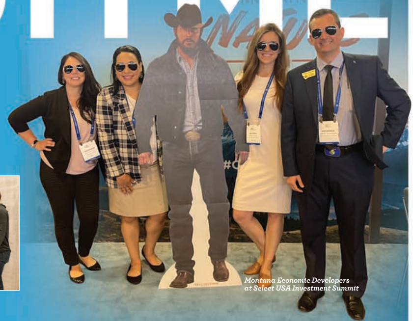
Montana Economic Developers at Select USA Investment Summit