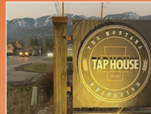
Montana Taphouse, SBA504 Project

Fun and Fancy Free Learning Center in Polson MT. The SBA 504 Loan program, in partnership with Glacier Bank, financed the expansion and new construction of the daycare facility serving the rural community of Polson and the Flathead Indian Reservation. The daycare has been serving the community since 1998. The new building allowed the owners to consolidate three locations into one, modern facility and increase capacity by 35%.