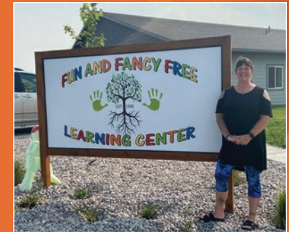
Fun and Fancy Free Learning Center, SBA504 Project