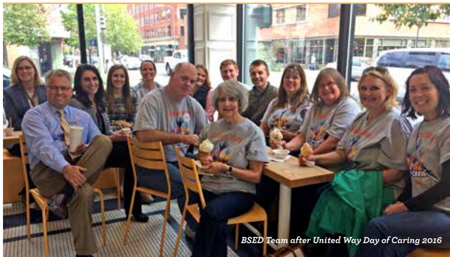
BSED Team after United Way Day of Caring 2016